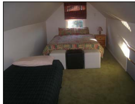
Hostel double / twin room