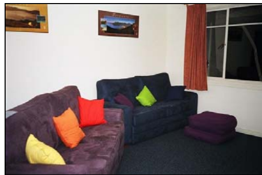
Lounge with TV and DVD