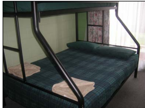
Hostel double / twin room