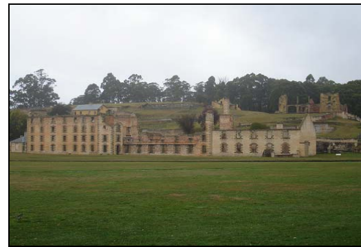
Port Arthur Historic Site