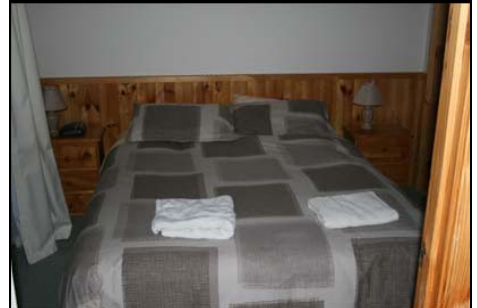
Double room with en-suite