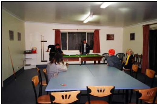
Dining and games room